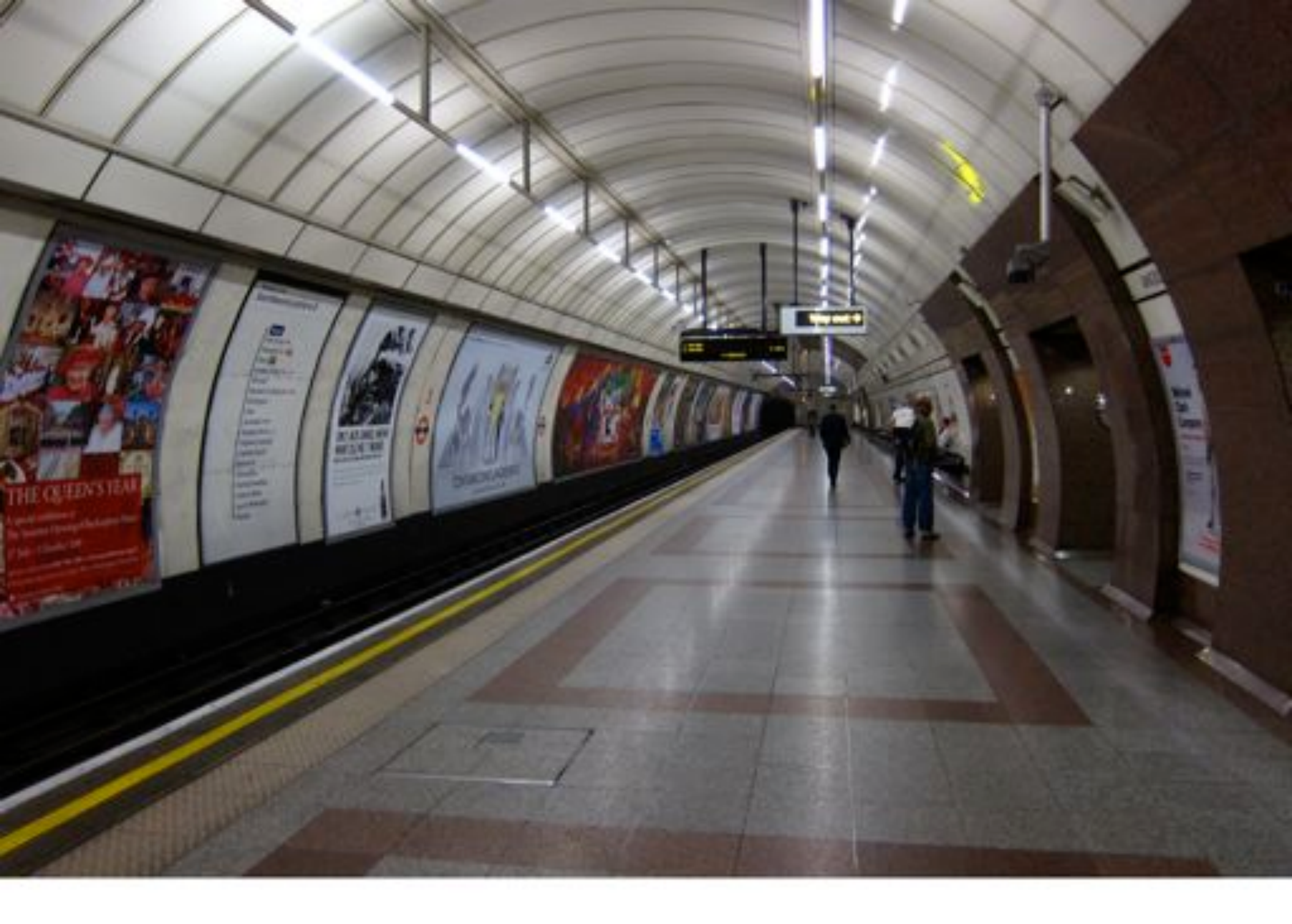
The Angel Islington | St Paul's Cathedral