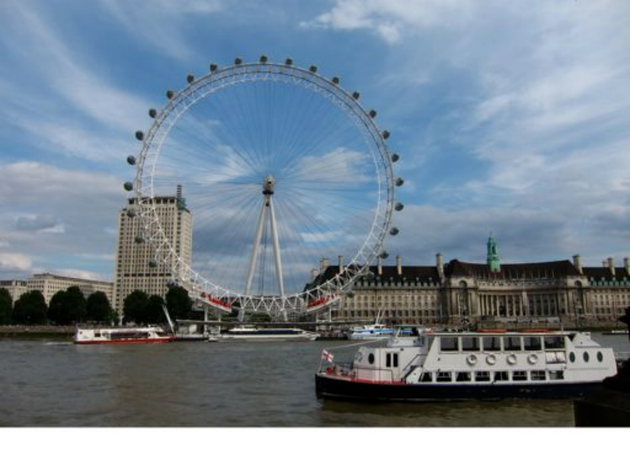
The London Eye