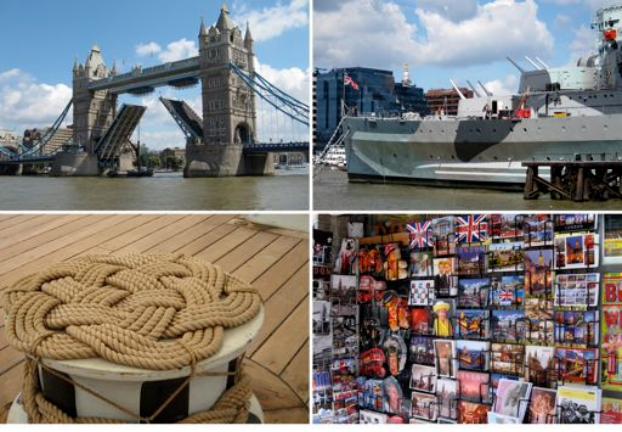
Tower Bridge | HMS Belfast