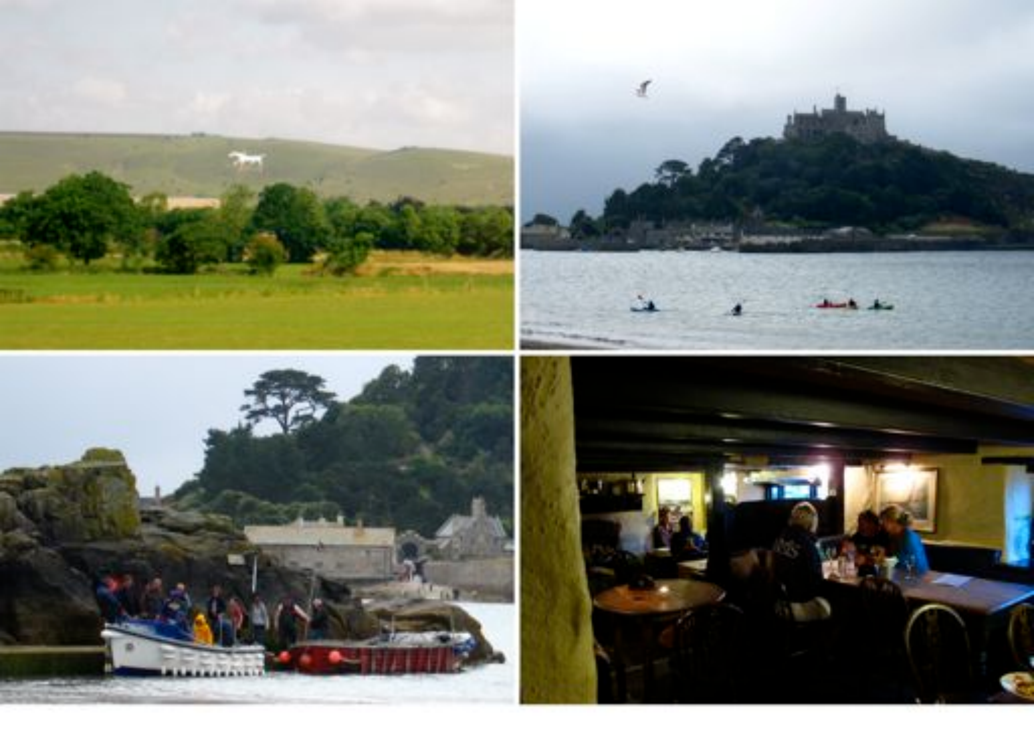
Cornwall (and en-route)