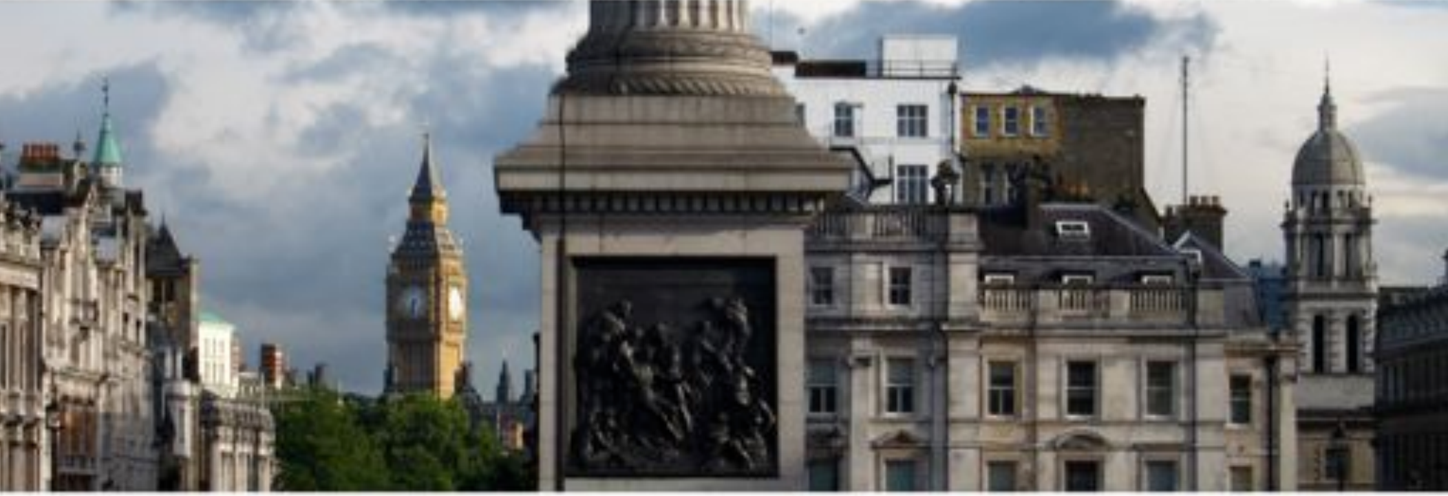
Millennium Bridge | Big Ben viewed from Trafalgar Square