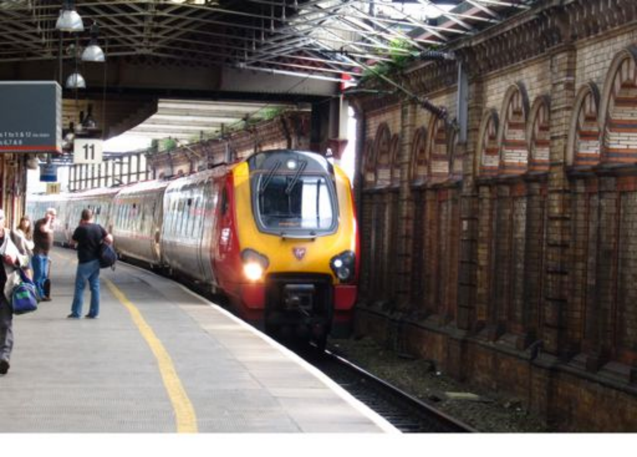
Scotland & en route