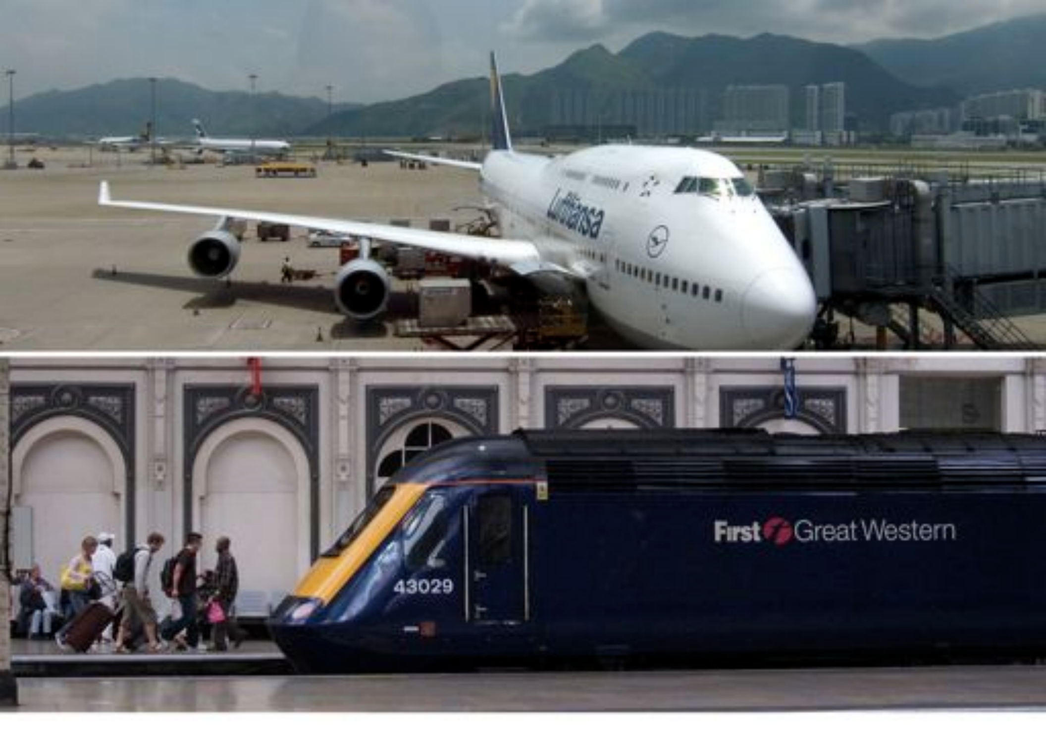
Hong Kong Airport | Paddington Station London