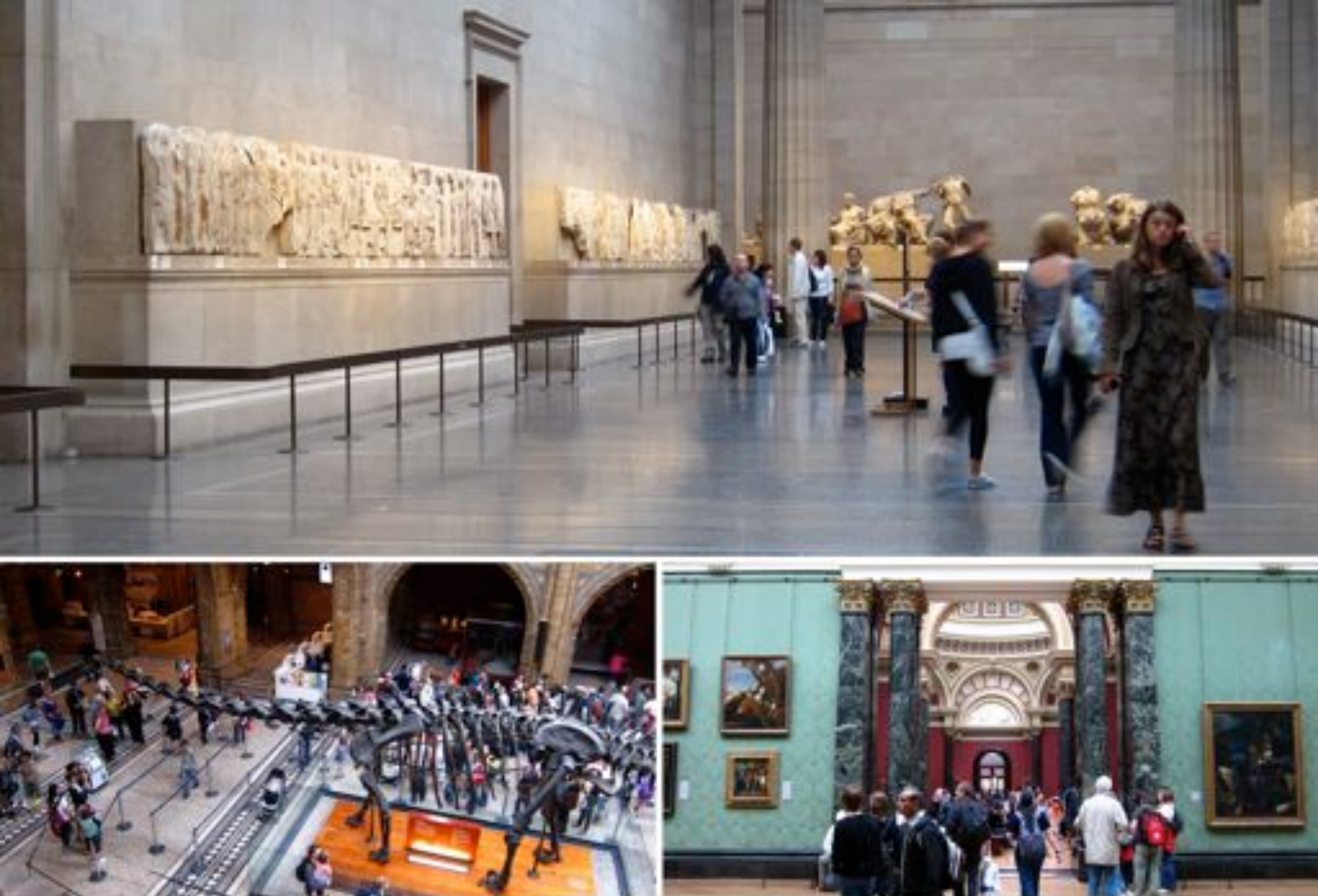
Museum's and Galleries