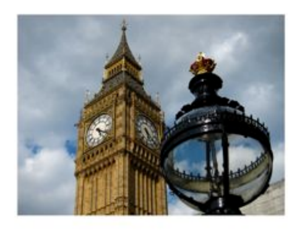
Britain and USA Trip Photographs 2010